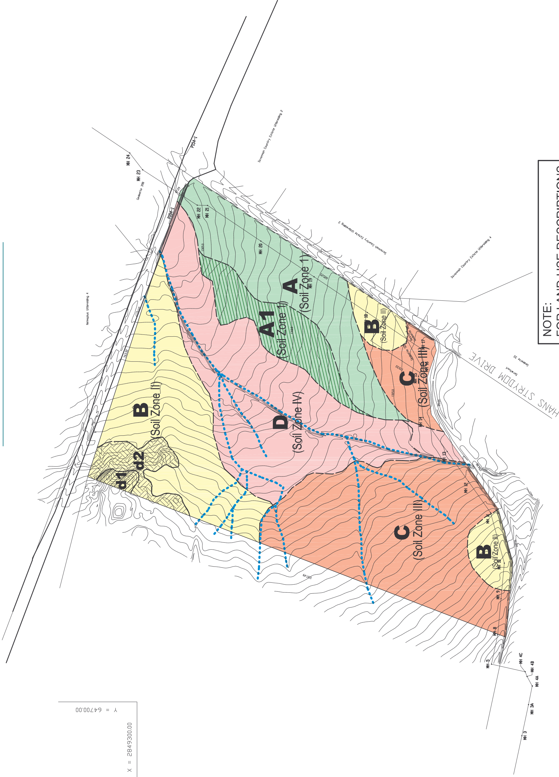
FIGURE 3: LAND-USE MAP